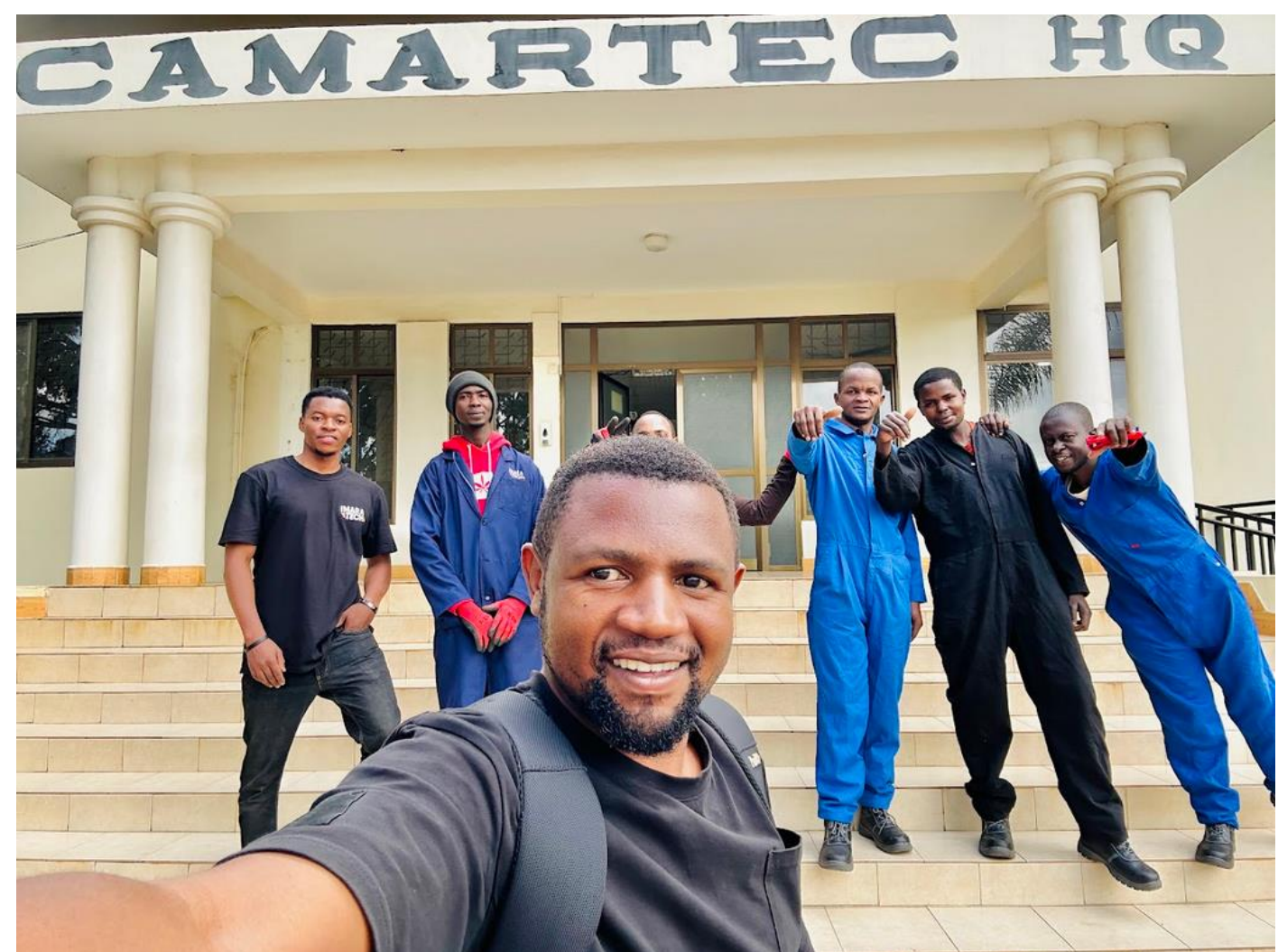
Technician training at CAMARTEC